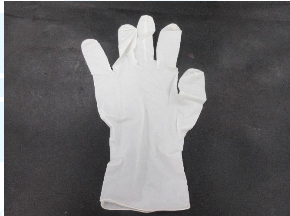
Samples described as NPF 2001-2006 Disposable nitrile glove (white) size XS/6-XXL/11