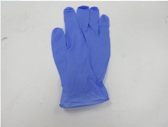
Samples described as NPF 2001-2006 Disposable nitrile glove (blue) size XS/6-XXL/11